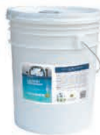
ECOS® Pro Laundry Detergent Free & Clear 170 oz, 1 gallon, 5 gallon and 55 gallon