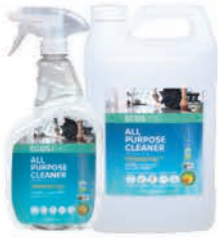
ECOS® Pro Orange Plus® All Purpose Cleaner Comes in RTU and Degreaser, Concentrated 1:128 32 oz, 1 gallon and 5 gallon sizes