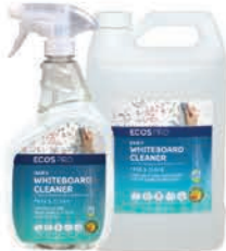
ECOS® Pro Daily Whiteboard Cleaner Free & Clear 32 oz and 1 gallon