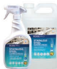
ECOS® Pro Stainless Steel Cleaner & Polish Free & Clear 32 oz and 1 gallon