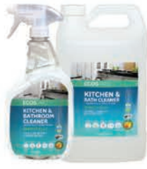
ECOS® Pro Parsley Plus® Kitchen & Bathroom Cleaner 32 oz and 1 gallon sizes