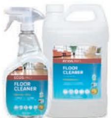
ECOS® Pro Floor Cleaner Orange Plus® 32 oz and 1 gallon