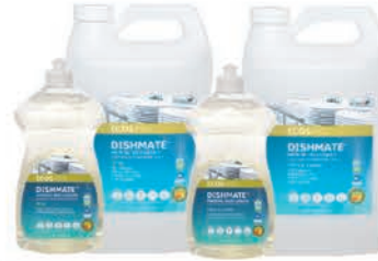
ECOS® Pro Dishmate® Manual Dish Liquid Pear and Free & Clear - 25 oz, 1 gallon, 5 gallon, 55 gallon