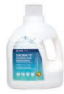
ECOS® Pro OxoBrite® Oxygenating Whitener 8.5 lb