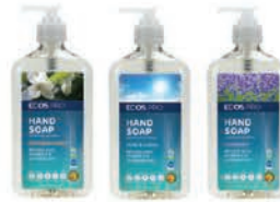
ECOS® Pro Hand Soap Lavender, Orange Blossom, Free & Clear 17 oz pump and 1 gallon