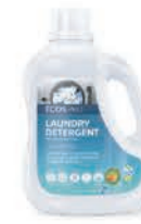
ECOS® Pro Laundry Detergent Lavender 170 oz, 1 gallon, 5 gallon and 55 gallon