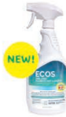
ECOS® Pro One-Step Disinfectant Cleaner Fragrance Free - 24 oz