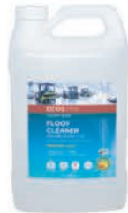
ECOS® Pro Floor Cleaner Concentrated 1:128 Orange Plus® 1 gallon and 5 gallon