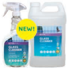
ECOS® Pro Glass Cleaner Vinegar RTU and Concentrate 1:128 RTU: 32 oz and gallon sizes 1:128: 1 gallon & 5 gallon