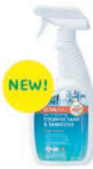
ECOS® Pro Multi-Purpose Disinfectant & Sanitizer Fresh Citrus - 32 oz