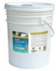
ECOS® Pro Wave® Commercial Automatic Dishwasher Gel Free & Clear - 5 gallon pail and 55 gallon